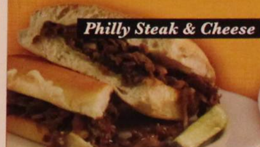
Philly Steak & Cheese

Layers of sliced deli ham and American cheese 5.19